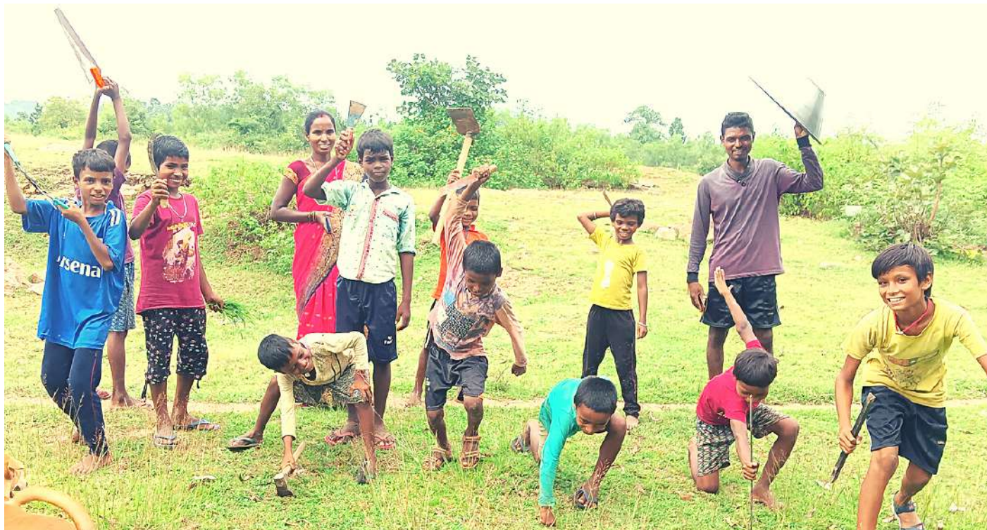
ANANTMOOL TEAM AFTER DOING FARM WORK